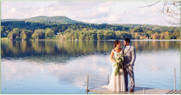
Eric Limon Photography