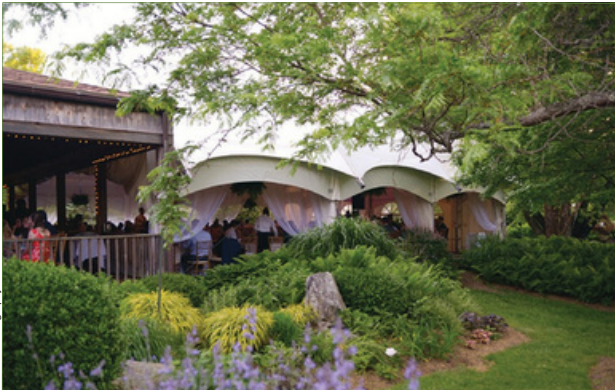
Dani Fine Photography