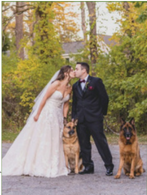
Yours Truly Media