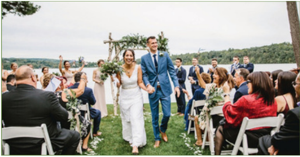
Aaron & Whitney Photography