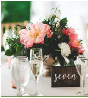
Sarah Churchill Photography